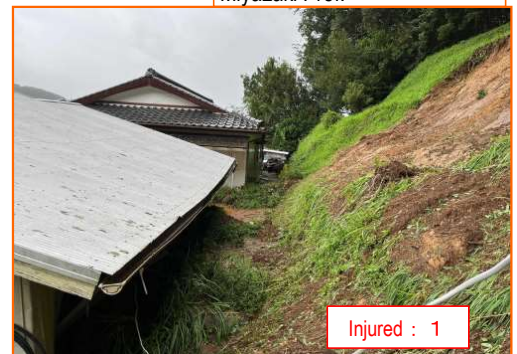
Sep.19 Nanaore, Hinokage Town, Miyazaki Pref.