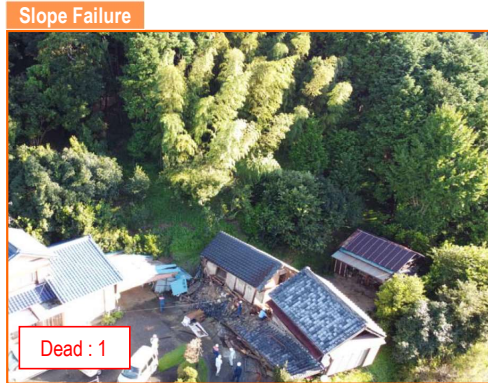
Sep.24 Yuke, Kakegawa City, Shizuoka Pref.

Casualties: Dead 4 Injured 8 House : Destroyed 33 Half Destroyed 39 Partially Destroyed 212