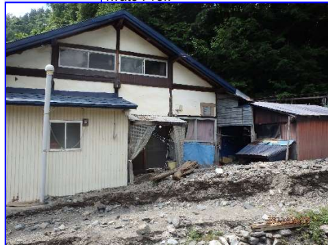
Aug. 3 Tareyanagi, Kuzumaki Town, Iwate Pref.