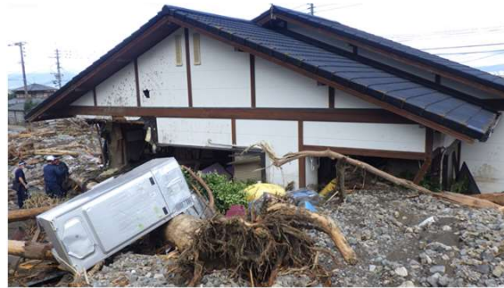
Debris flow hit a town