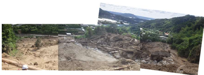
Inundated, Sedimentation area