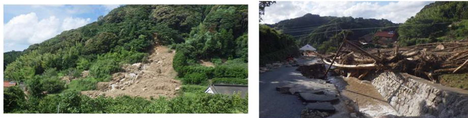
Debris flow hit a village.