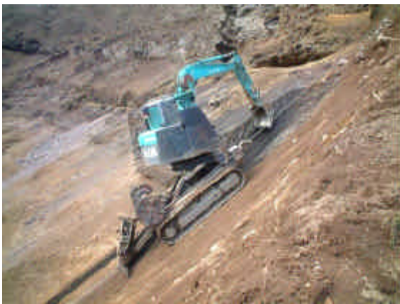
Photo-1 Excavating Work by Rock-climbing Machine