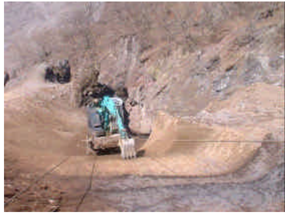
Photo-2 Seeing from the upper part of the slope