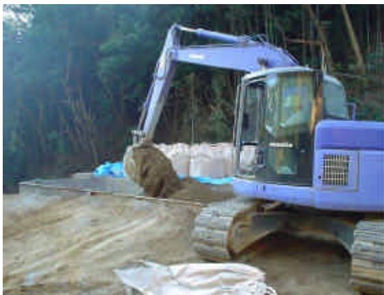
Mixture of cement

Due to fair weather, placement work of as much as 1,600 m 3 was completed within one month and the target strength 1.5N/mm 2 was attained. The construction cost was successfully reduced by as much as 70 percent.