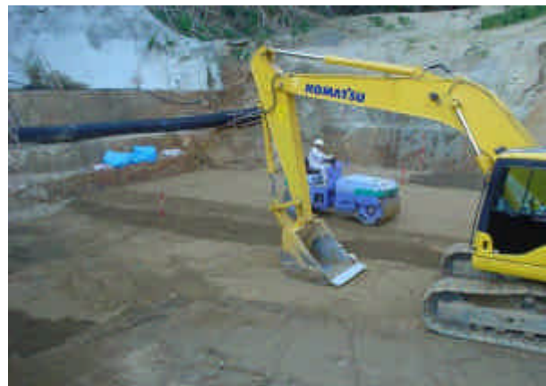
Spread and smooth