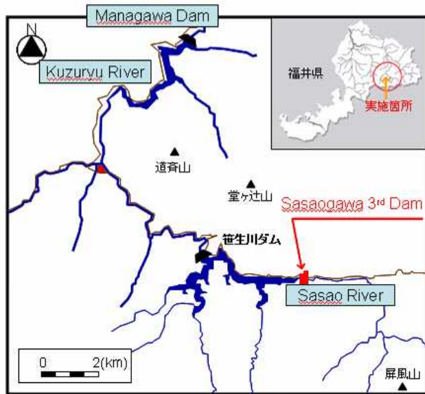
Figure 1 Location of Sasaogawa 3 rd Dam

In the Sasaokawa valley, a tributary of the Managawa river in the Kuzuryu River system, Sasaokawa dam, a multi-purpose dam, had been constructed in order to prevent flood discharge and to generate electricity. In the dam reservoir sedimentation had been taking place more rapidly than projected so that the storage capacity of the reservoir has been getting smaller than expected.