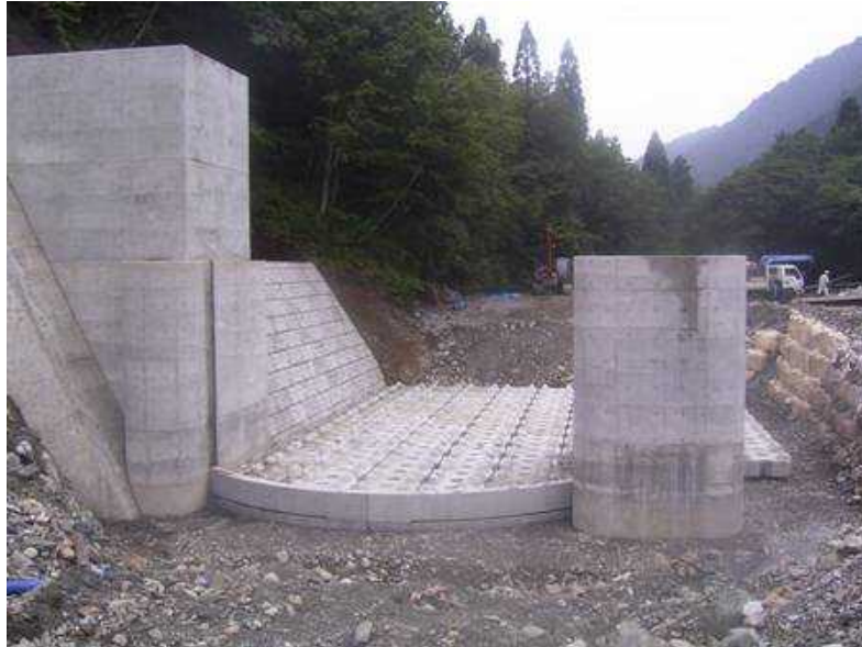
Photograph 1 Front View of the P.A.P. Dam (under construction)

Taking into account the above all the conditions it was decided that P.A.P. dam technology was the most appropriate.