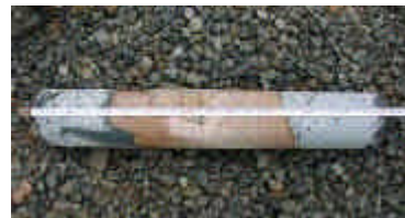
Coring test state