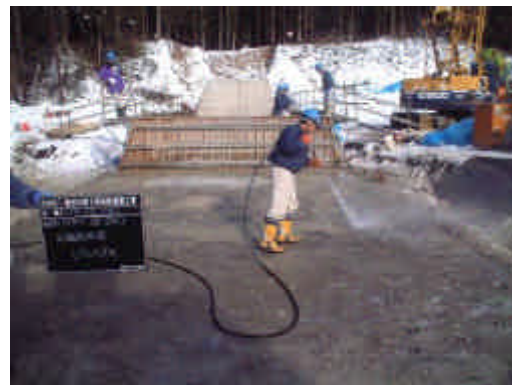
Placement joint cleaning state