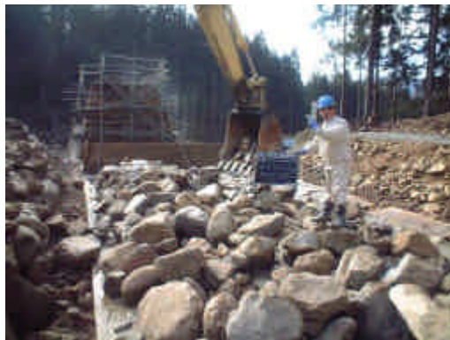
Placement boulders state