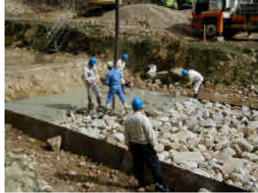
Pouring concrete state