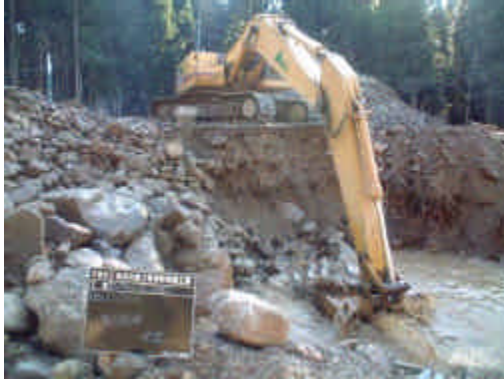
Washing boulders state

The volumetric rate of boulders is approximately 50 %. High fluidity concrete required to fill all the voids results in rather high unit cost of concrete, but, as a whole, the new boulder concrete method is proved to be cost-effective.