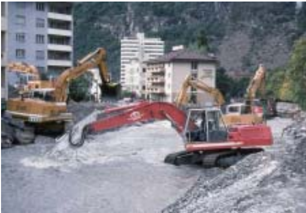
River Saltina, City of Brig 1993 Peak discharge 100 m 3 /s; Damage: 500 mio Sfr