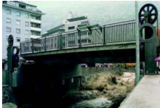
River Saltina, City of Brig 2000 Peak discharge 125 m 3 /s; No damage