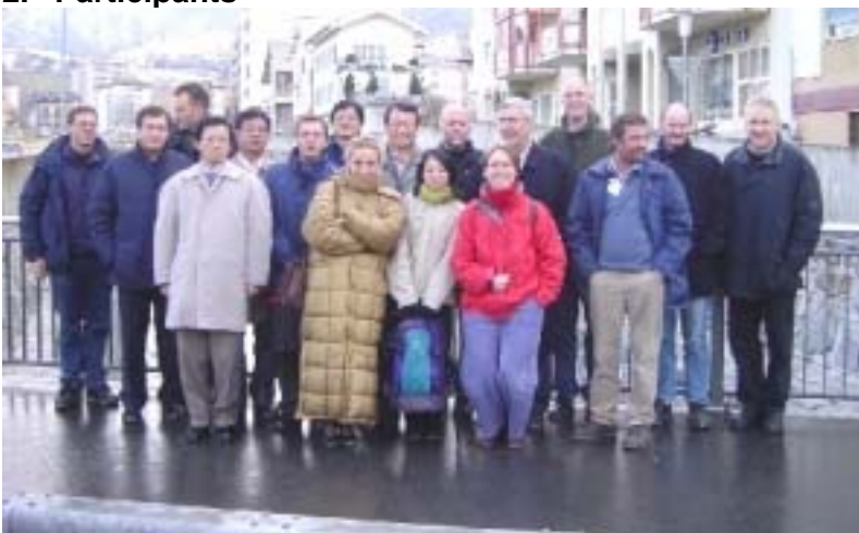
City of Brig, December 2002