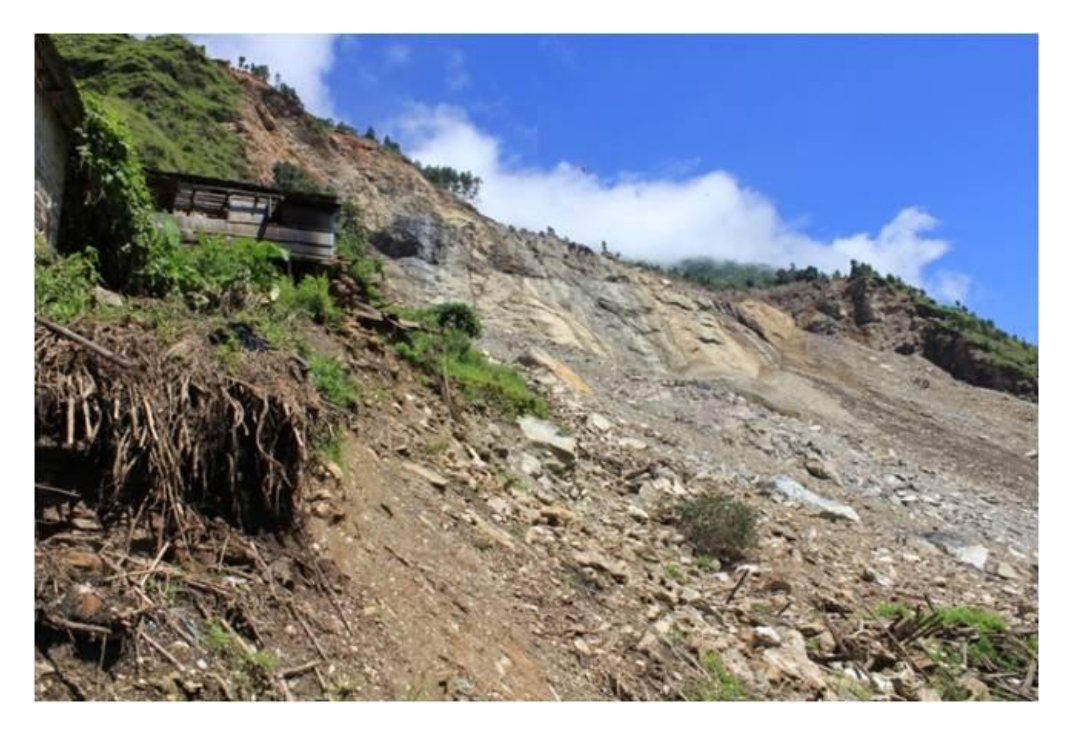
Figure 9: Landslide near the damaged village Iteni