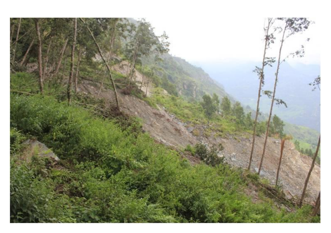
Figure 2: Cracks and disturbed surface in the Crown part of the Jure Landslide

near the Tate village since 2 years and the location was descended with some kind of sounds just two days before the disaster event. In the mean time, the villagers were shifted from that location to safe site before two days knowing such a hazardous condition of the site. The landslide in the crown part was initiated at about 5Am in that day as per the villagers. The village road near the Tate village also was damaged by the landslide event (fig.5) but it is now maintained by the villagers. The villagers of the Tate village mentioned that the crown part area of the landslide was in risky condition since long time ago.