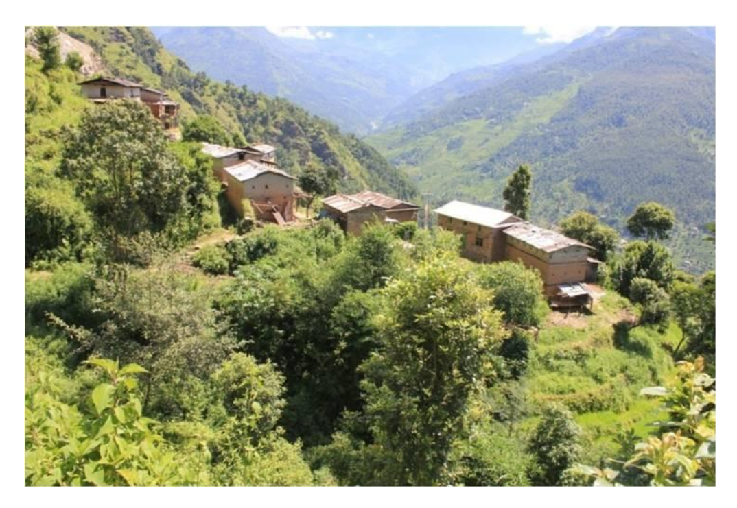
Figure 11: The vulnerable remaining part of the Iteni Village