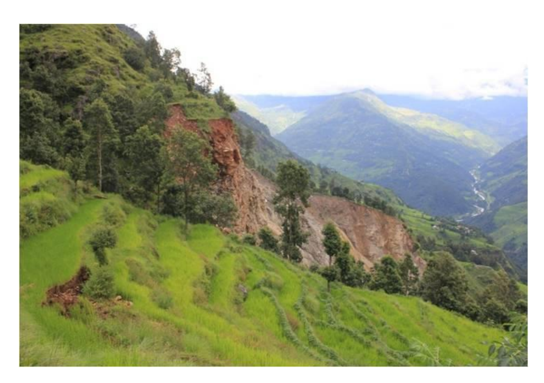
Figure 7: Hanging block at the upper boundary part of the Landslide

4.2 Crown part to near the Iteni village: There is still existence of large cracks, huge rock boulders and fragments, springs in many places in this area. Debris is flowing down. The slope of this area is much steep (fig 7 &8). Still it can be observed the falling of the rocks from the crown part. The weathered rock bridge (shoulder of the landslide in centre part) about 200m thick is made up of black plyllite and quartzite but in the site it is seen as grey and yellowish in color. These conditions of the rocks are due to the interaction of water and chemical weathering since long time back. It is most probable to rock fall, topple and debris flow in this area in near future due to existence of sufficient spring water and fractured rock debris.