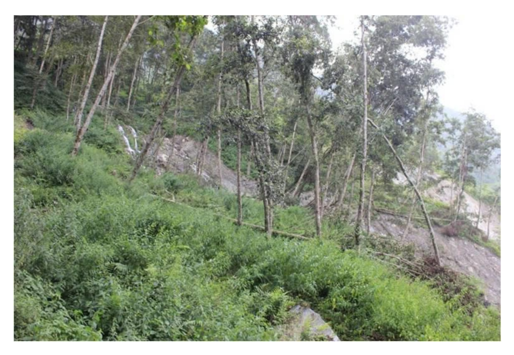
Figure 3: Disturbed and inclined trees in the crown part of the Landslide