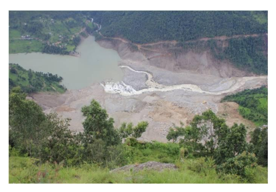
Figure 13: Opening of Secondary Channel in the Landslide Dam

September 7, 2014 at 1am and continued up 4Am (Fig. 13 and 14). Since the breaching occurred slowly and it took about 4hrs, the damages by the breach were nominal and no causalities. The Department of Hydrology and Metrology recorded the discharge during the breaching of the dam at Pachuwaghat real time gauze station which was located at downstream from Khadichaur Bridge. As per the record, the normal flow was 300 cu.m/sec and the maximum discharge was 1350 cu.m/sec and the historic capacity of channel was 1700-1800 cu.m/sec. So the maximum flow was within the capacity. After the breaching of the dam, the water level in the reservoir was decreased by 20m. The study Report of Hazard Mitigation in the Northern Sunkoshi and Bhote Koshi Water Catchment Areas, Nepal (HMWA), 1996 reported that under the Natural dam, the River terrace of sand, clay and gravel boulders were existed.