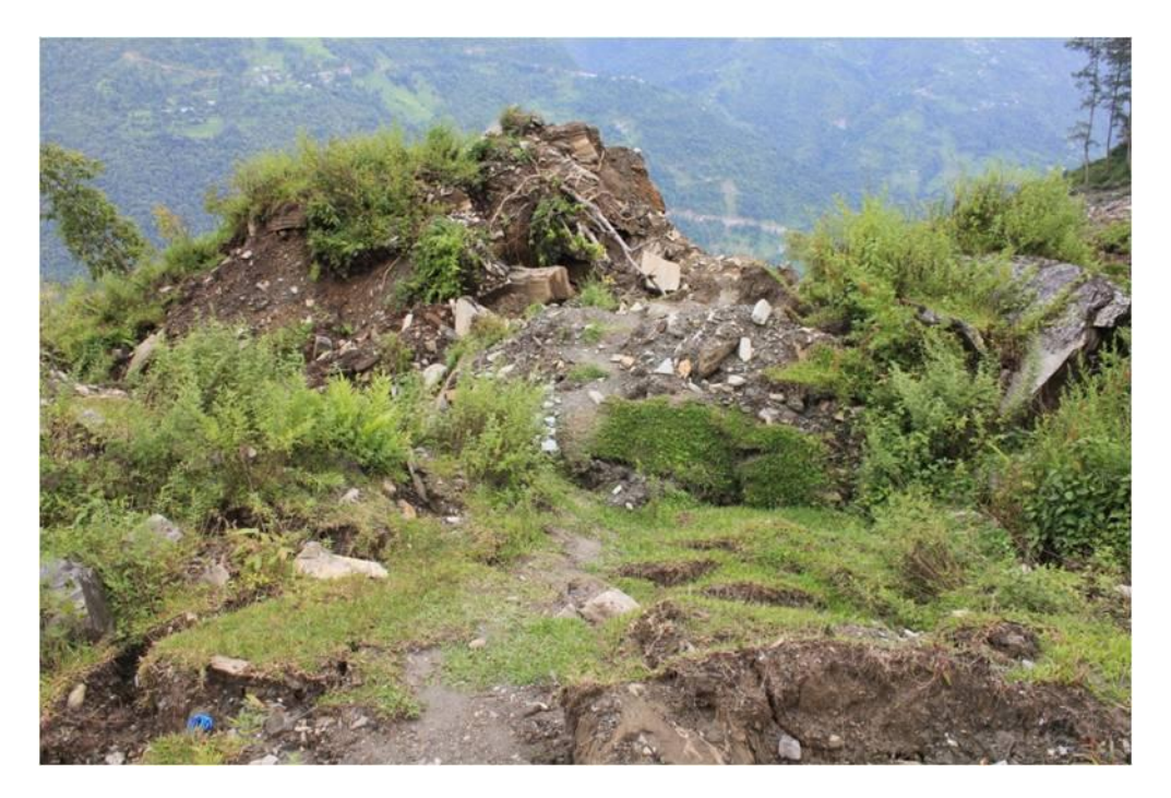
Figure4: Cracks and ready to move mass in the Crown part of the Landslide