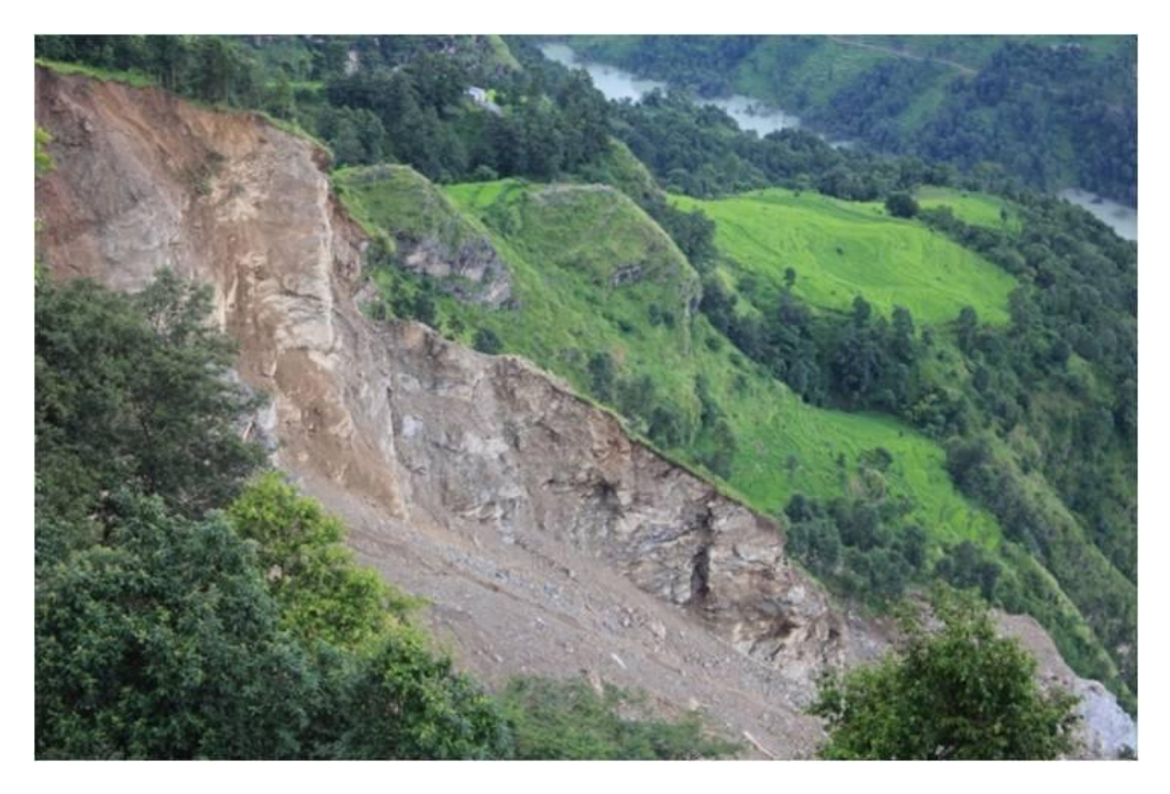
Figure 8: Big cracks near the border of Landslide

4.3 Nearby the Iteni village part: There is a comparatively hard rock bridge (shoulder) about 100m down from this area where debris fan is deposited about 20-25m span. There are some huge rock boulders/fragments of about 3m*3m*2m size which are in high hazardous condition that could be fell/roll down any time. In this place, the debris is still flowing down continuously. Here the part of the Iteny village is completely damaged (fig 9, 10, 11).