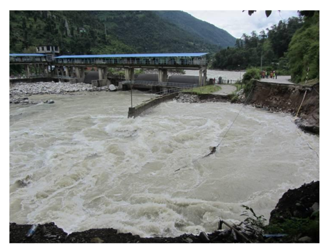
Figure 14: Damaged Sunkosi Hydropower Headwork and Araniko Highway after breach of the Landslide Dam

4.7 Left bank area of Sunkosi Natural dam: During the Jure landslide and Natural damming in Sukoshi river event, it damaged the left bank of the Sukoshi area also. The Dabi khola area was completely damaged. The surging of the landslide material damaged the opposite bank upto 100m height. The utensils food grains from Jure landslide area were spread to the opposite bank up to the height of 100m. On the other hand the dust came out from the event were spread out and covered about five sq km area.