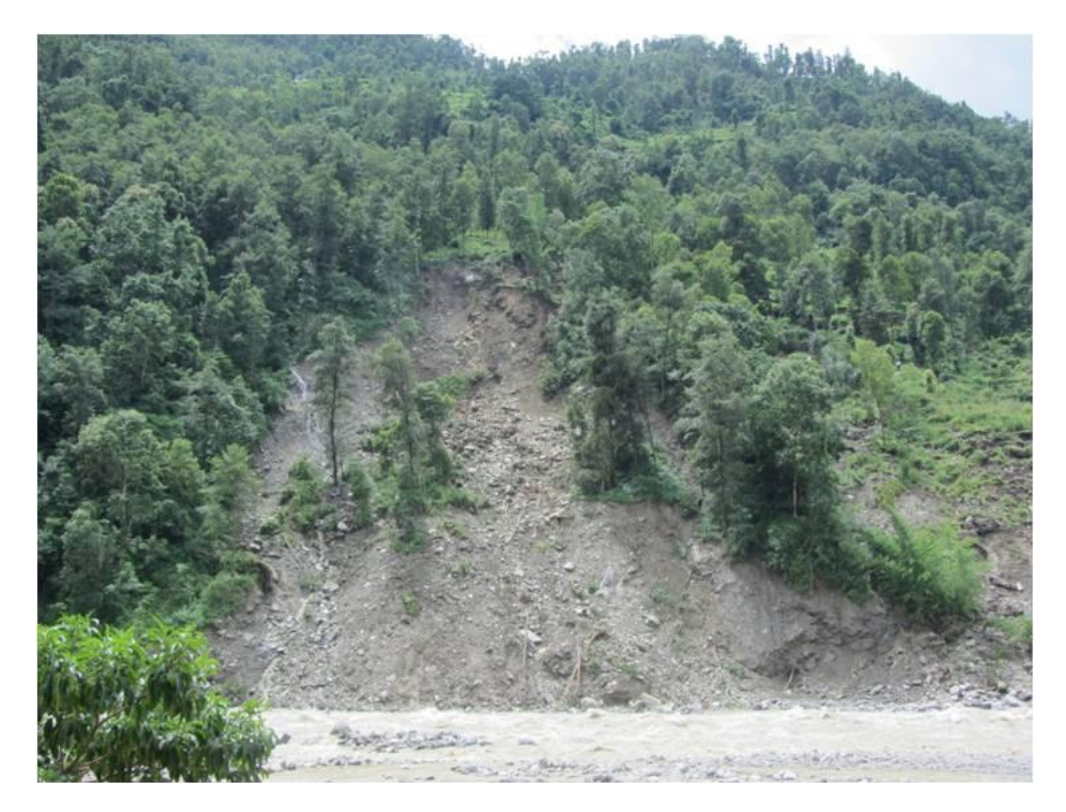
Photo 6: Landslide occurred at left bank of Sunkoshi after breach of Dam