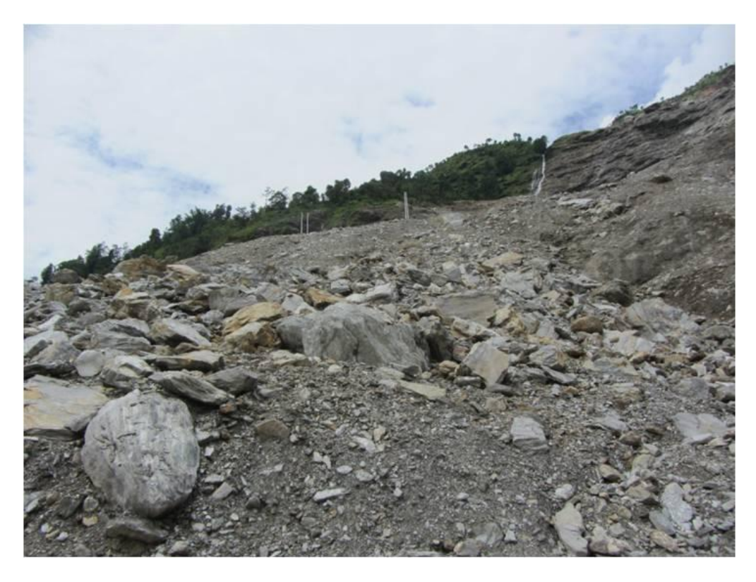
Figure 12: Debris deposited at the toe part of the Landslide

4.6 Landslide Natural Dam in Sunkoshi: The length of the dam across the river was measured about 350m, the width of the dam along the river was measured about 700m and the height of the dam was about 55m. The primary channel for outlet of the trapped river was opened on August 2, 2014 at about 2pm by Nepal Army with the help of experts from Department of Water Induced Disaster Prevention DWIDP. The opening method of the channel was mainly blasting but the rock type of this area is mainly schiest and phyllite, due to which it was felt difficult to progress the deepening of the channel. In this stage the experts and decision makers in the special committee formulated by Ministry of Home Affairs decided to open secondary channel. The experts located the secondary channel at middle part of the dam to open. Thus the secondary channel was opened on August 30, 2014 in the morning at central part of the dam by Nepal Army with blasting and excavation by two numbers excavators. In the same way, Nepal Army excavated the approach road to the dam site. The Nepal Army continued to widen the inlet of the secondary channel upto 52m wide on September 6, 2014. Rainfall in the watershed was occurred in the night of September 6. Due to more widening of the inlet of the secondary channel and occurrence of rainfall in the watershed, the dam was pressurized by water and hit and scour in the weak part of the dam. In the result the dam was breached on