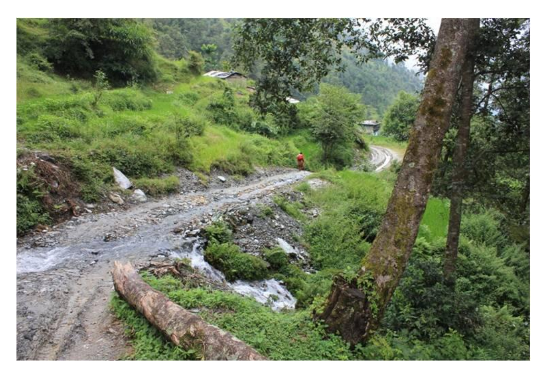
Figure 5: Subsided village road in the crown part of the Landslide