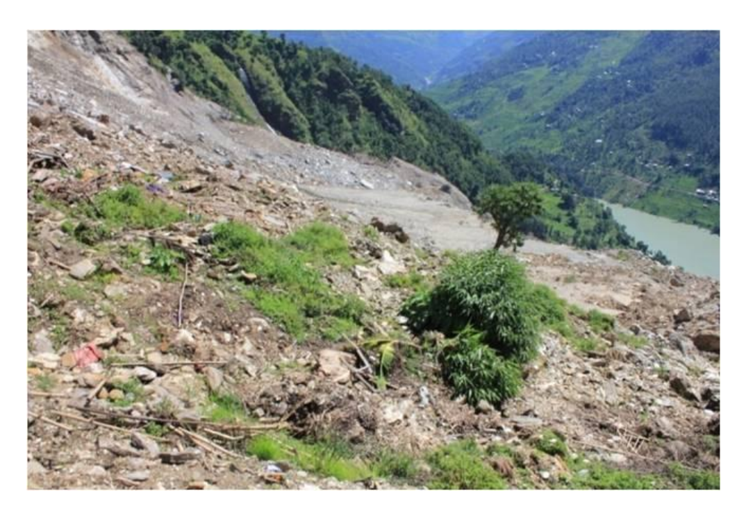
Figure 10: Landslide block moving down near the Iteni Village