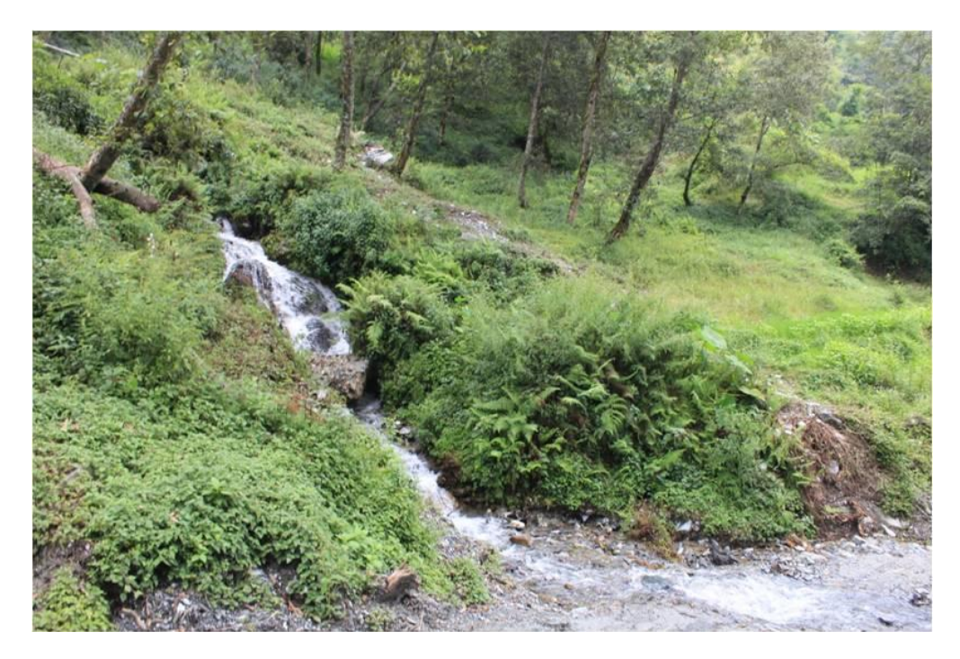
Figure 6: Streams flowing at the Crown part of the Landslide