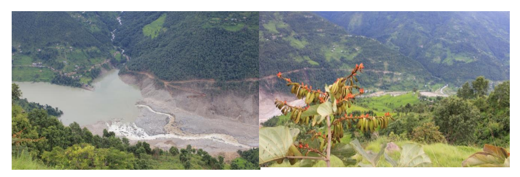
Figure 15: The alternate temporary road to Barahbise constructing by Nepal Army