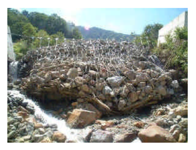
Photo-2 Checking the debris flow in Kamikami-Hori torrent of Mt. Yake dake

The Wire Net method had been developed and implemented by Ministry of Construction in 1973, but the method has not been used because it was thought that the nets was not tough enough against debris flow. The method has however advantage in work period and site codition. The method is featured by simplicity in terms of structural design, materials, construction process and safety management so that the method had been improved by adding rings and employed at Kamikami-Hori torrent of Mt.Yake dake and Dashihara torrent of Mt.Tateyama All the cases demonstrate that the wire net method is effective enough successfully checking debrisflows.