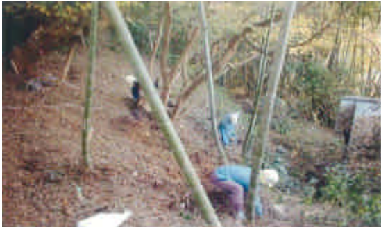
The situation of steep slope with broad leaf tree and bamboo

The slope is as high as 40 meters and is located eastern part of the steep range of hills. The slope is as steep as 30 degrees or more up to 50 degrees and covered well with thick natural vegetation, but the slope surface has been heavily weathered so that the area was prone to rock fall and slope failure.