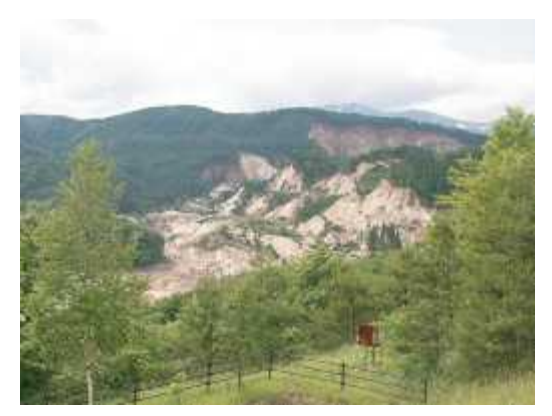
Disaster in Kurihara City by Iwate-Miyagi Nairiku Earthquake (Japan, 2008)

Disaster in Siaolin Village by Typhoon Morakot (Taiwan, 2009)