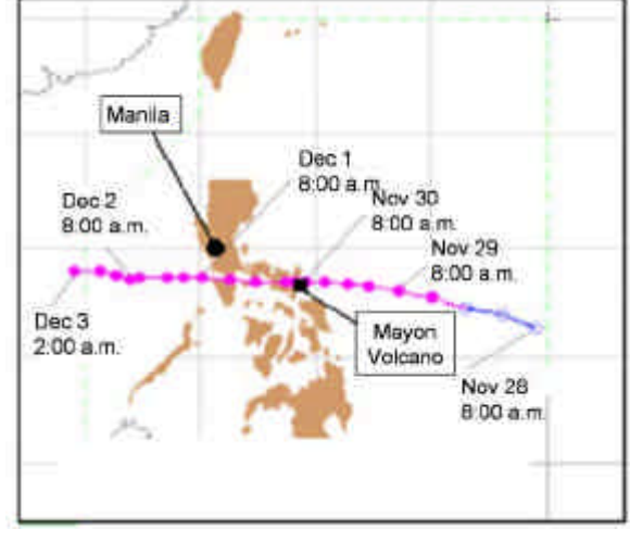
Fig.1 Location of Mayon Volcano and track of Typhoon Durian

Mayon Volcano is an active volcano located at the southern end of Luzon Island (Fig. 1). It is a beautiful stratovolcano admired as a sightseeing spot, but it also brought about a number of disasters to the surrounding area. To mitigate damage around this volcano, the PHilippine Institute of VOLCanology and Seismology (PHIVOLCS) prepared a hazard map in 2000. Japanese sabo experts sent to this country in the past by Japan International Cooperation Agency (JICA) also provided a volcanic mudflow monitoring system (telemeter hourly rainfall gauges, wire sensors) to this area.