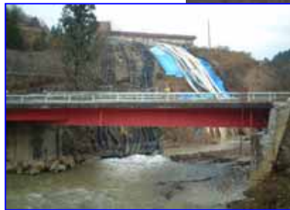
State of the emergency drainage section