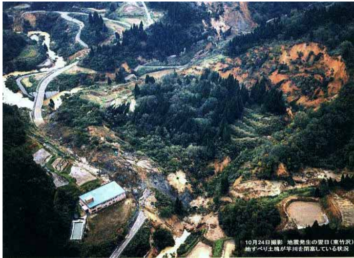
Just After Occurrence (Oct. 24, 2004)

Measures taken for the blockade of a river course (Higashi-Takezawa area)