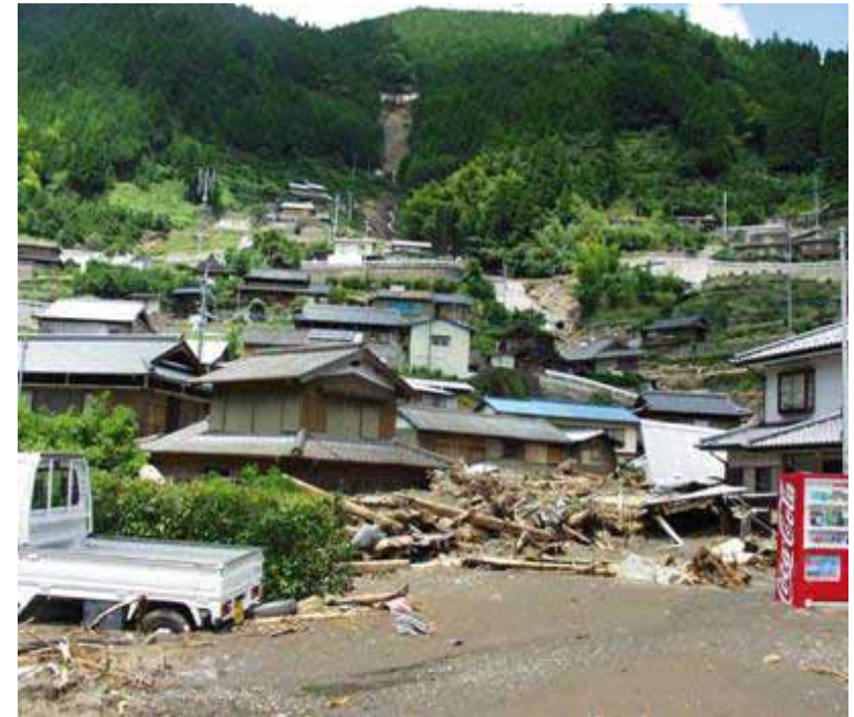
Siraishi, Kaminaka Town, Naka Gun, Tokushima Prefecture (total collapse: 5, half collapse: 2, partial collapse: 3)