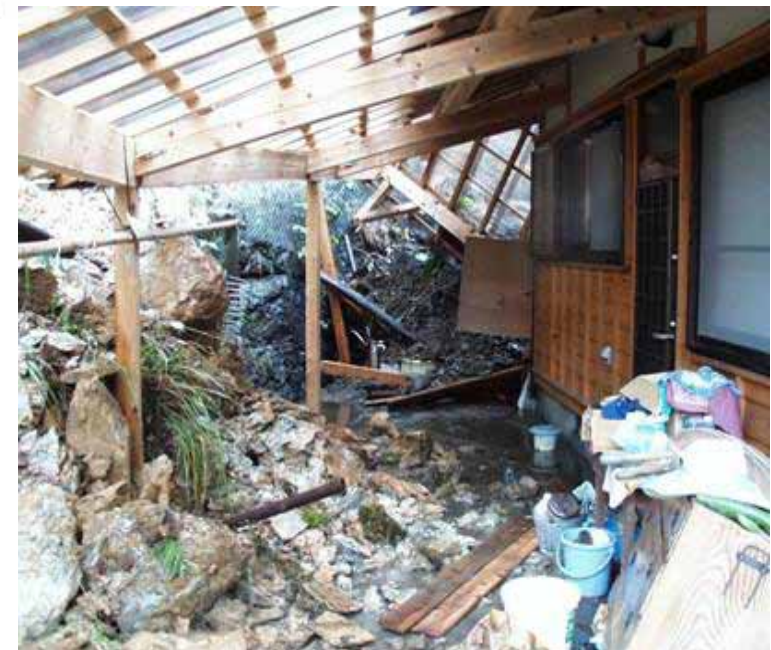
Collapse at Higashi-ishihara, Tosa Town, Kochi Prefecture (partial collapse: 1)